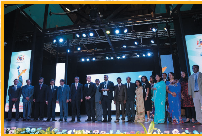
Case Noyale Social Welfare Centre