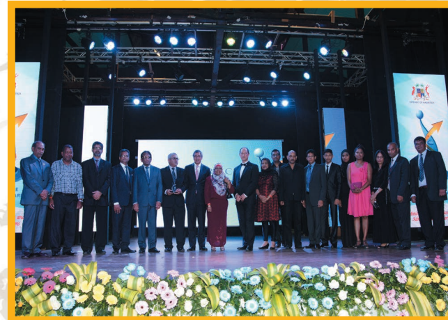
Sir Abdool Razack Mohamed State Secondary School