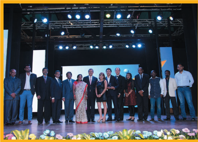
Mauritius Business Growth Scheme Unit