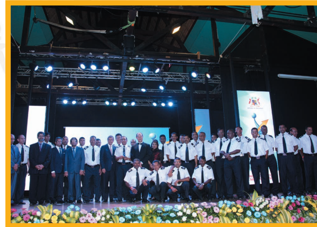
Mauritius Fire and Rescue Service