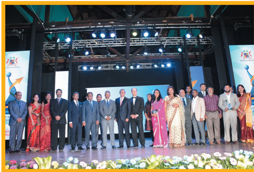
Gastro-Intestinal Endoscopy Unit, SSRN Hospital