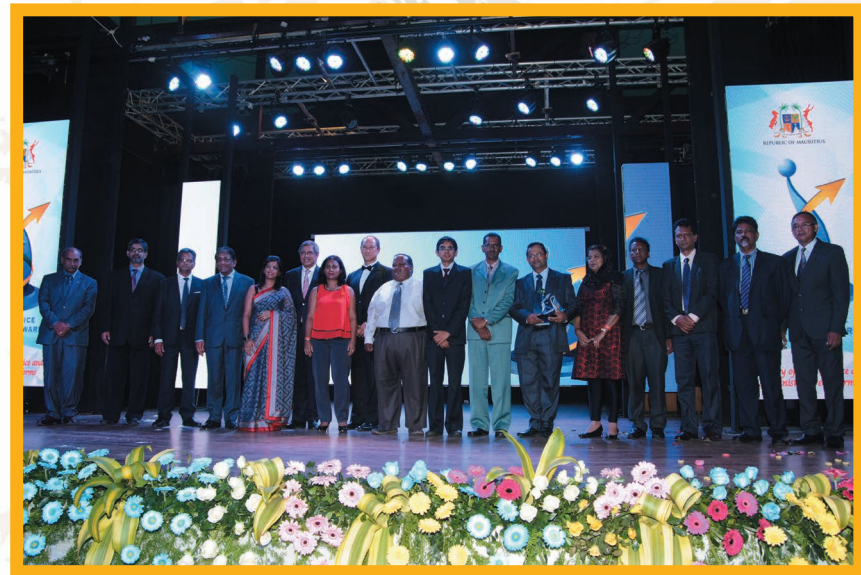
Sir Leckraz Teelock State Secondary School