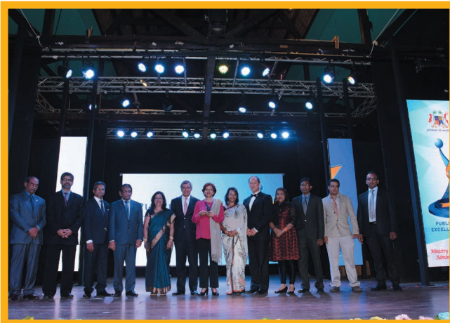
Forensic Science Laboratory