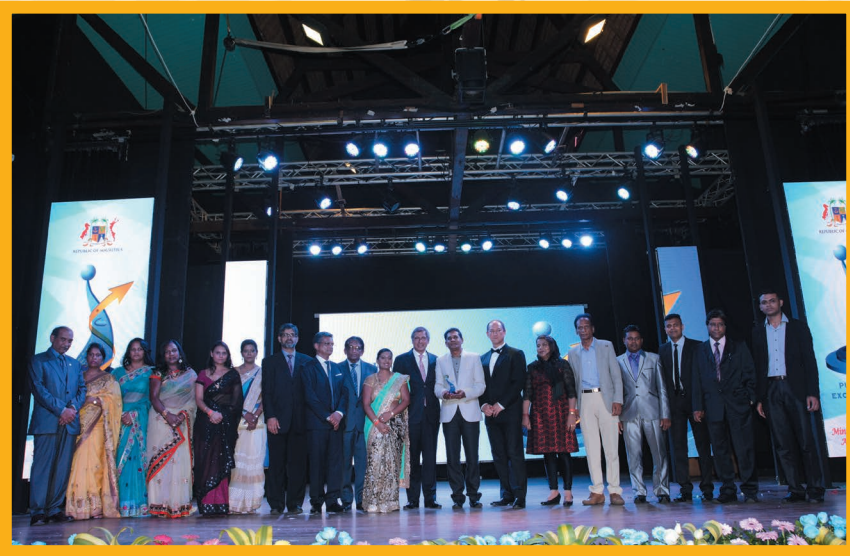
Flacq Haemodialysis Unit