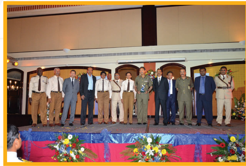
Mauritius Prisons Services