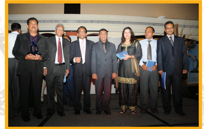
Ministry of Industry, Science and Research