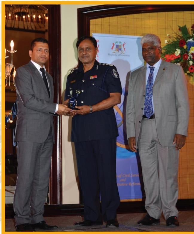
Police Planning and Reforms Unit