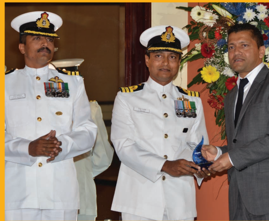
National Coast Guard Headquarters & Operations Room and Maritime Air Squadron