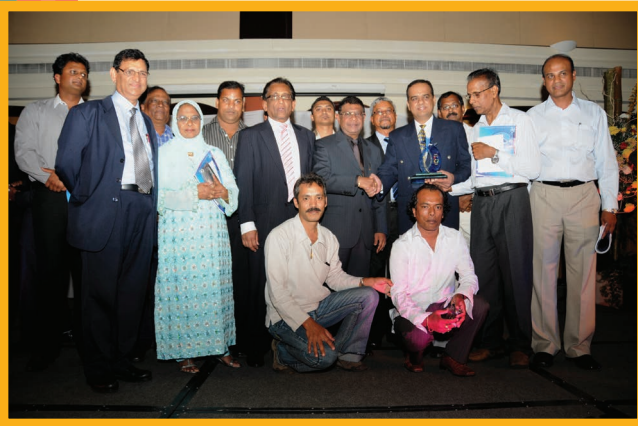
Lady Sushil Ramgoolam Mediclinic