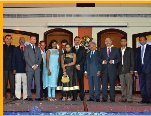
Nuclear Medicine Department, J. Nehru Hospital

... Special Mention by the Panel of Jury