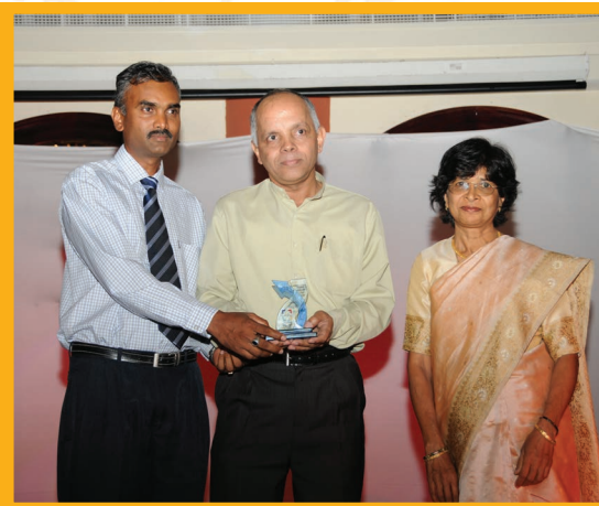
Entomology Division, Ministry of Agro-Industry, Food Production and Security