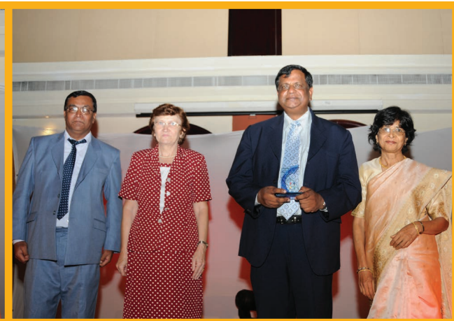
Water Resources Unit, Ministry of Renewable Energy and Public Utilities