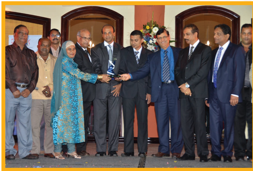
Lady Sushil Ramgoolam Mediclinic