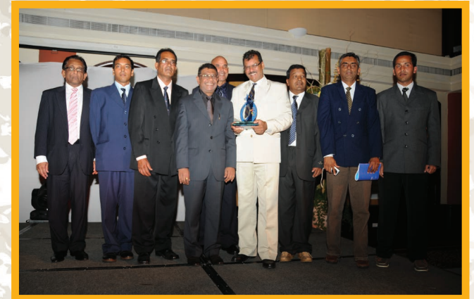
Biodiversity Unit, Forestry Services