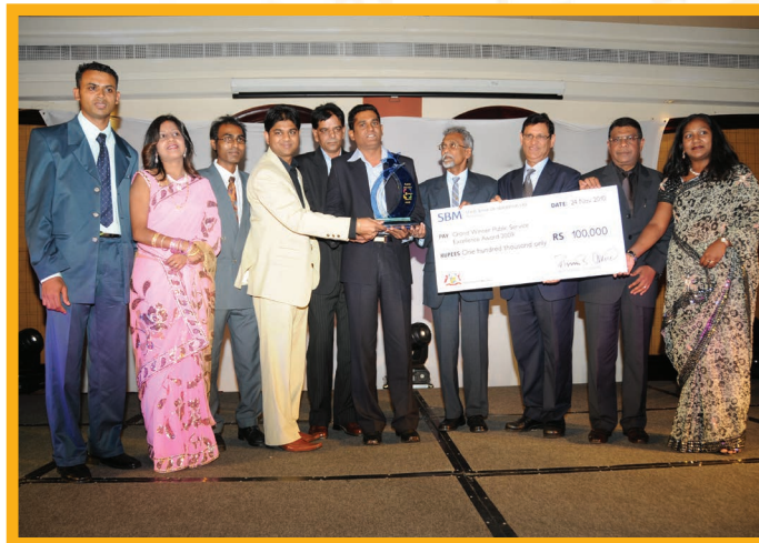
Haemodialysis Unit, Flacq Hospital