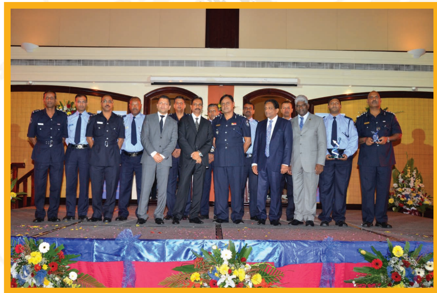
Police Planning and Reforms Unit