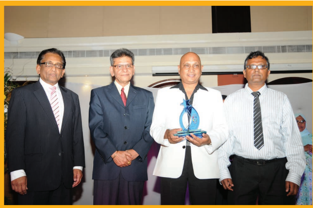
Energy Services Division