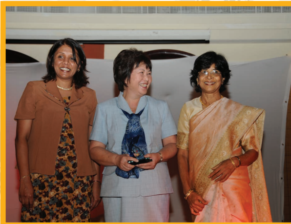
Information & Education Division, Ministry of Environment & NDU

... Special Mention by the Panel of Jury