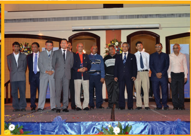
Energy Services Division