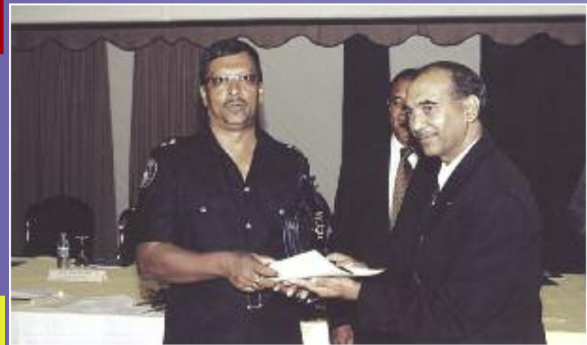
Pointe aux Canonniers Police Station