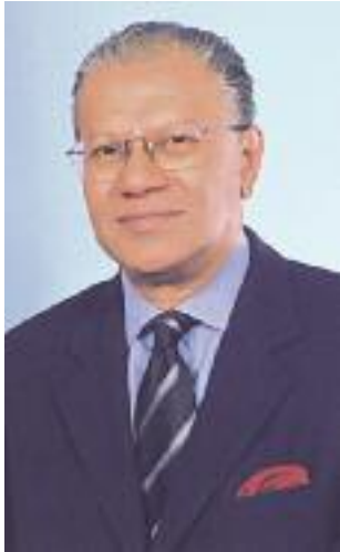
Dr the Hon Navinchandra Ramgoolam, G.C.S.K. Prime Minister Republic of Mauritius

The Public Service Excellence Award (PSEA) is an effective motivational tool for Ministries and Departments to improve the quality of their services. It is regarded as a label of excellence as well as recognition.