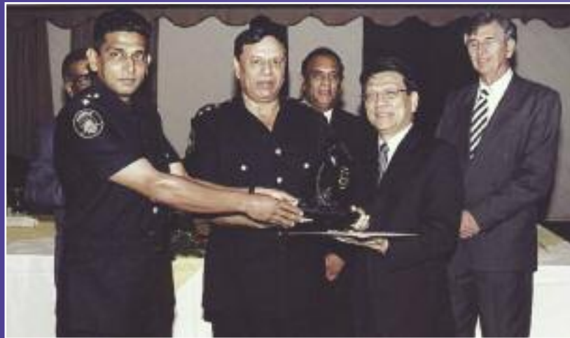
Floreal Police Station