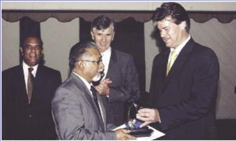
Civil Aviation Department