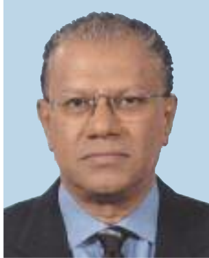
Dr. The Honourable Navinchandra Ramgoolam, GCSK, FRCP

Prime Minister of the Republic of Mauritius