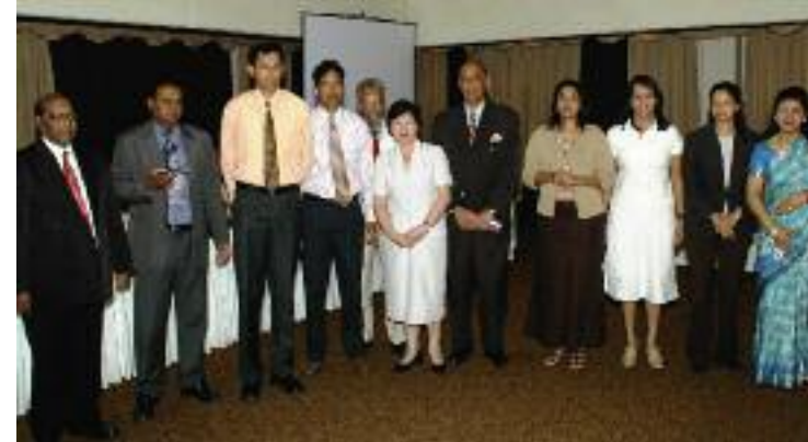
NATIONAL ENVIRONMENTAL LABORATORY