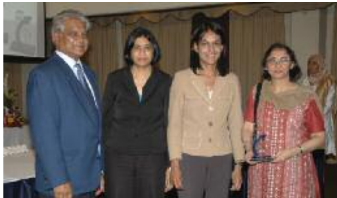
BIOCHEMISTRY DEPARTMENT, VICTORIA HOSPITAL