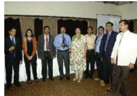
INNOVATION & IMPROVEMENT AWARD BIODIVERSITY UNIT FORESTRY SERVICES