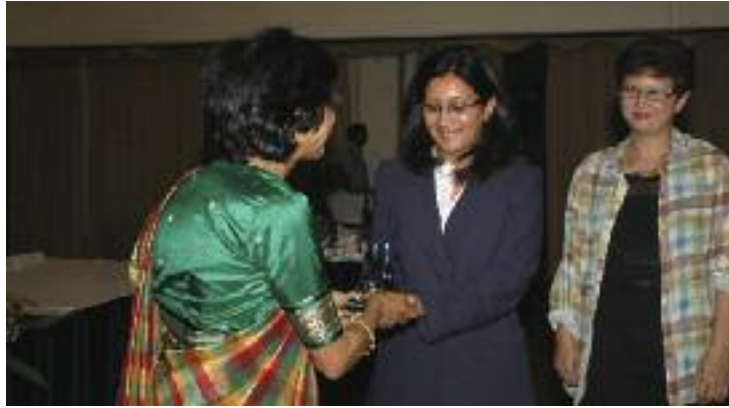
NEONATAL ICU SSRN HOSPITAL