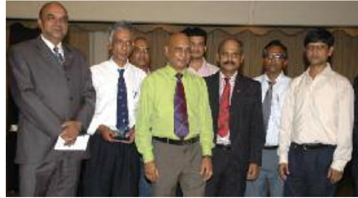
ENERGY SERVICES DIVISION