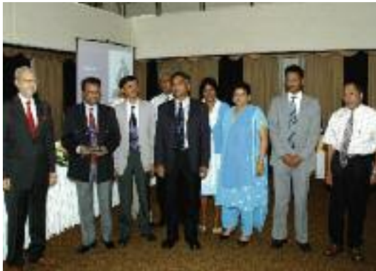
CUSTOMER FOCUS AWARD MAURITIUS METEOROLOGICAL SERVICES