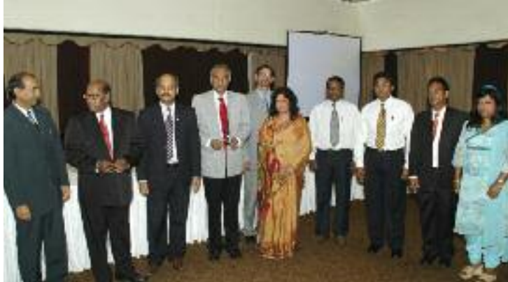
CITIZEN'S ADVICE BUREAUX (NETWORK)