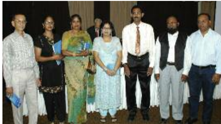
ABDOOL RAHMAN ABDOOL GOVERNMENT SCHOOL