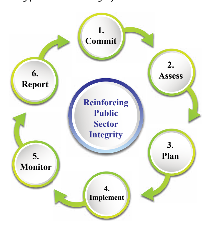
Figure 1 Six Steps to Public Sector Integrity Management

The six steps methodology is meant to assist Integrity Officers in assessing their organisations with a view to reinforcing public sector integrity.