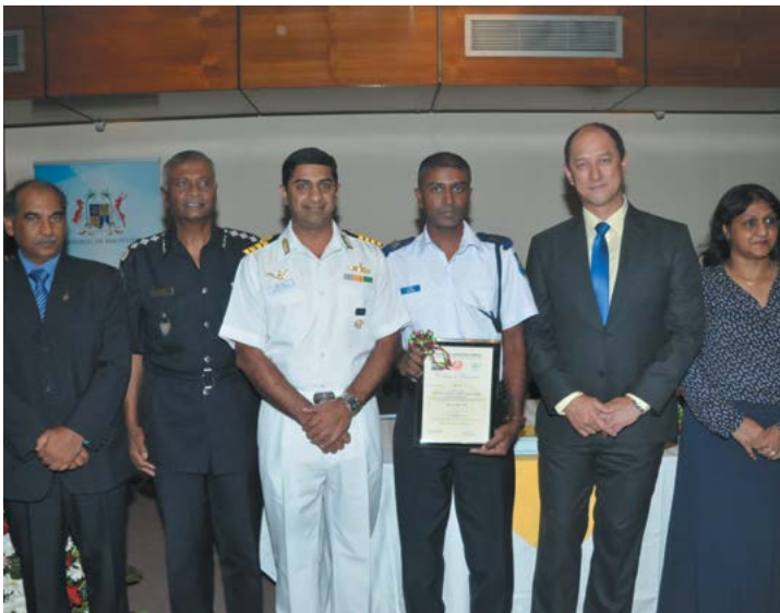
NCG HEADQUARTERS - ADMINISTRATION