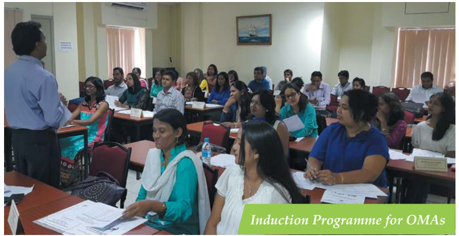
Induction Programme for OMAs

Some 80 officers from Ministries/ Departments grouped in three batches followed a two-half-day training programme on Basic ICT Security Awareness Programme organised by the Ministry of Civil Service and Administrative Reforms at Fooks House. The course aimed at sensitising OMEs and HRMIS Staff on existing threats in