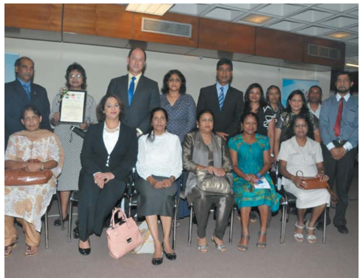
COMMISSION FOR CONCILIATION AND MEDIATION