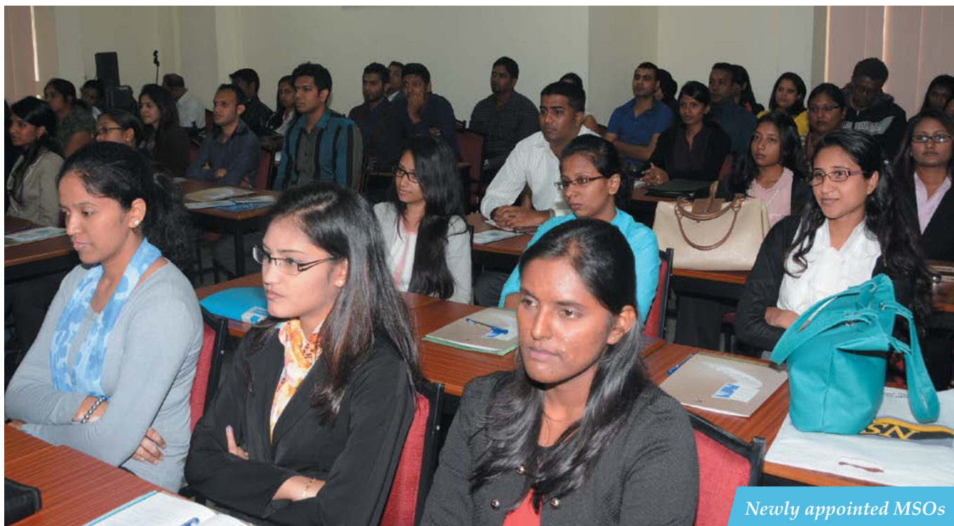
Newly appointed MSOs

Some 107 new recruits have joined the civil service in the position of Management Support Officers (MSO) following the advertisement of vacancies and the selection exercise carried out by the Public Service Commission on the basis of fairness, merit and qualifications.