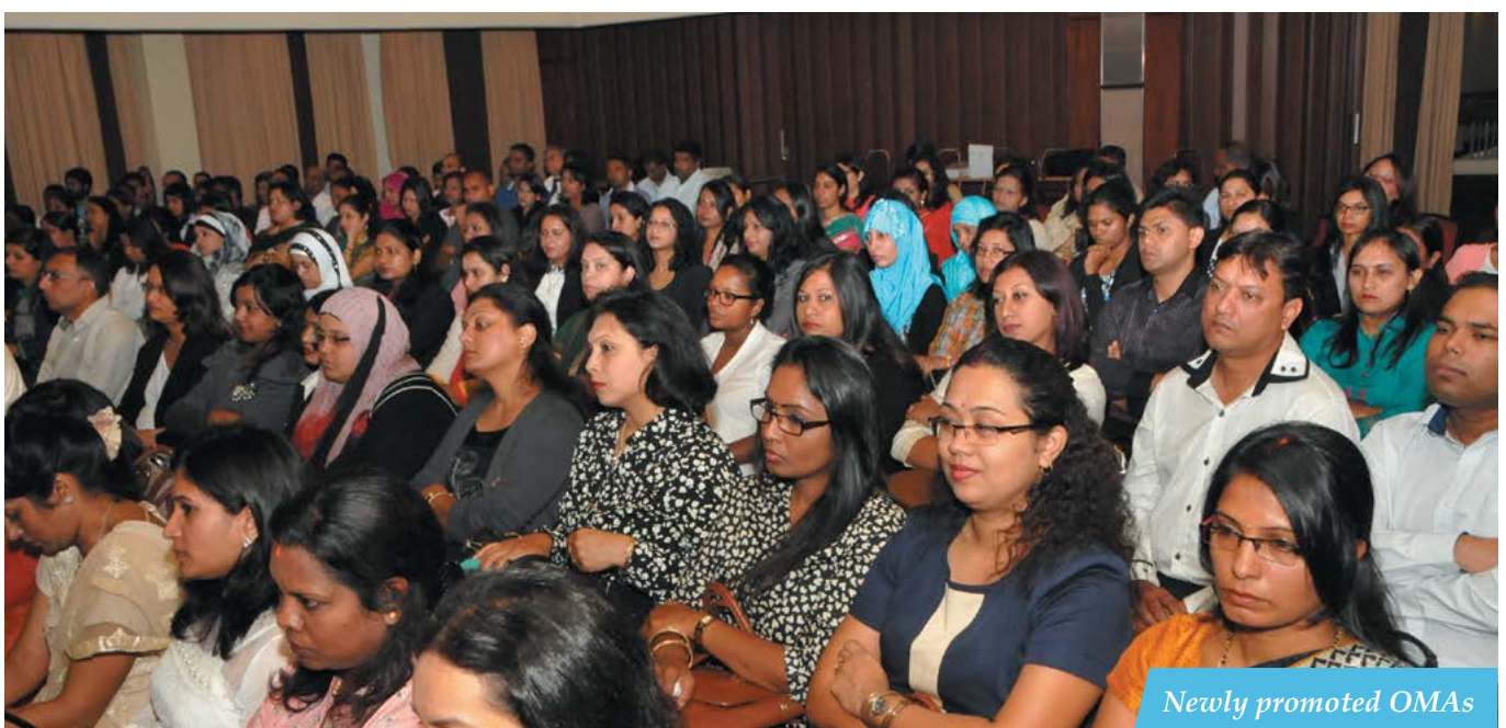
Newly promoted OMAs