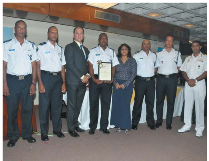
POUDRE D'OR NCG