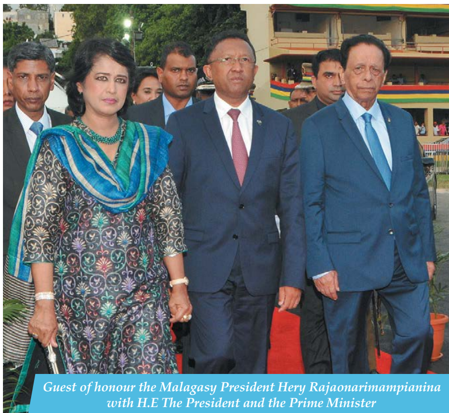
Guest of honour the Malagasy President Hery Rajaonarimampianina with H.E The President and the Prime Minister

In his message to the Nation in the context of the 48 th Anniversary of Independence of Mauritius and the 24 th Anniversary of its accession to the status of a Republic, the Prime Minister, Sir Anerood Jugnauth, expressed his confidence that the Government is well on the way to build a new future for the country.