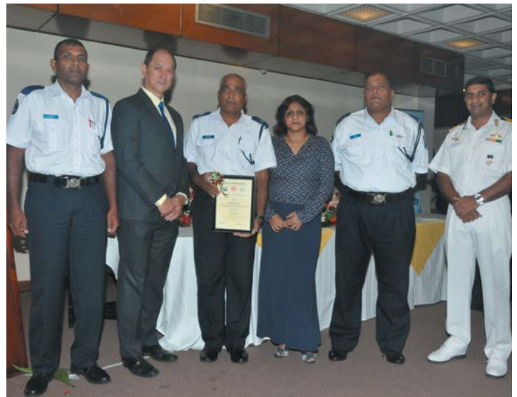
DEUX FRÈRES NCG POST