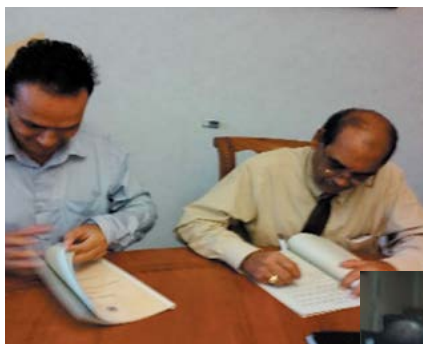
Signature of Procedure Agreement with GOAU on 17 June 2015

The Ministry of Civil Service and Administrative Reforms has signed Procedure Agreements with Union of Public Human Resource Professionals (UPHRP) and Government Office Attendant Union (GOAU) on 19 May 2015 and 17 June 2015 respectively.