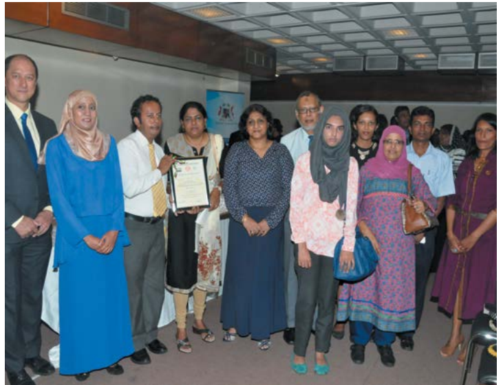
PROJECT PLAN COMMITTEE UNIT