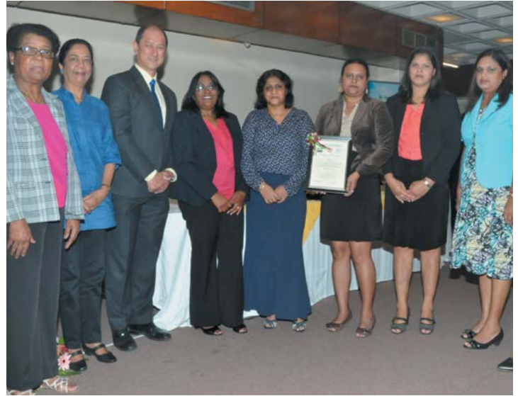
POLICE FAMILY PROTECTION UNIT