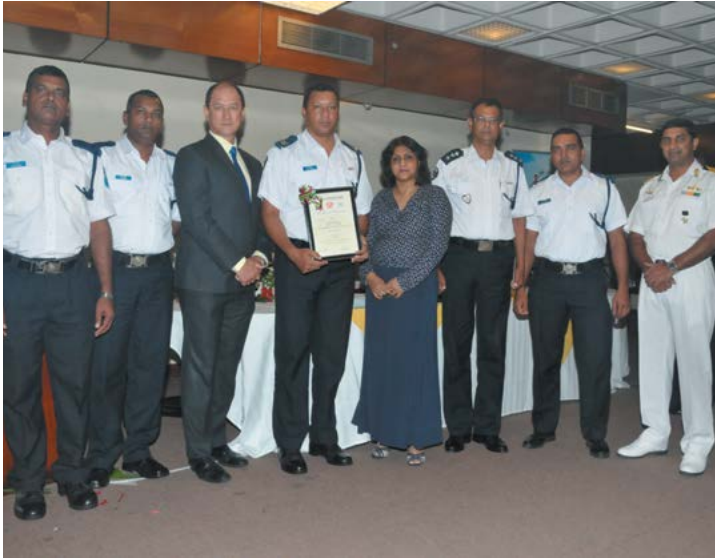
MAHEBOURG NCG POST