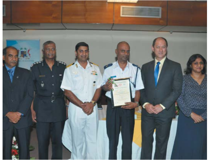
GRAND GAUBE NCG