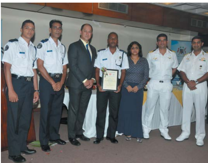
POLICE DIVING SCHOOL