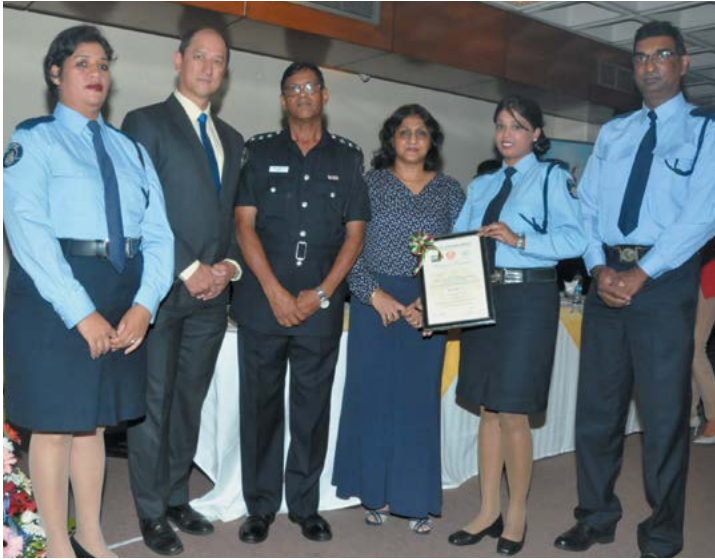
POLICE INFORMATION AND OPERATIONS ROOM