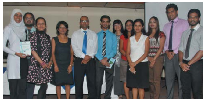
ELS Administration Staff including Course Integrators