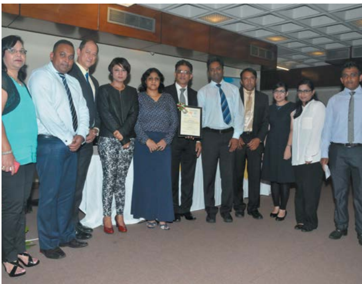
DATA PROTECTION OFFICE