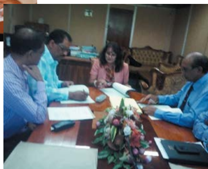
Signature of Procedure Agreement with UPHRP on 19 May 2015

One of the prominent features of the Employment Relations Act 2008 is the effective recognition of the right to collective bargaining. The fundamental principles of Collective Bargaining which aims at fostering harmonious and sound employment relationships in the Public Service is one of the International Labour Organisation's Conventions which act as an instrument for trade unionism in Mauritius. It is an important form of social dialogue.