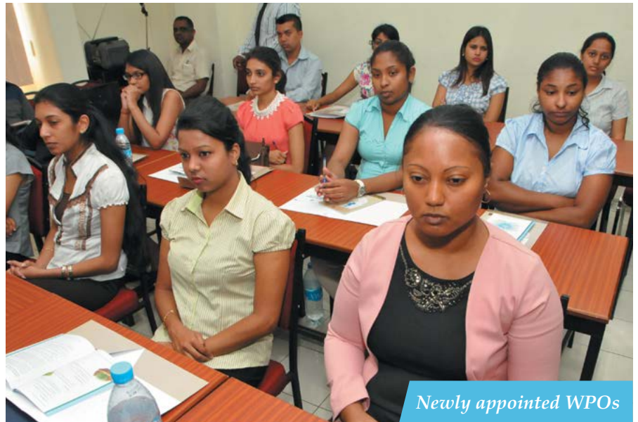
Newly appointed WPOs

Some 290 Officers in the grade of Management Support Officer and 33 Management Assistants were promoted to the grade of Office Management Assistant and Office Management Executive respectively and were posted in different Ministries/ Departments.