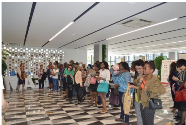
Fieldwork in Hangzhou Future City

Ph.D., Professor of Sociology, President of China Women's University, specialized in international communication, media and Women's Studies.