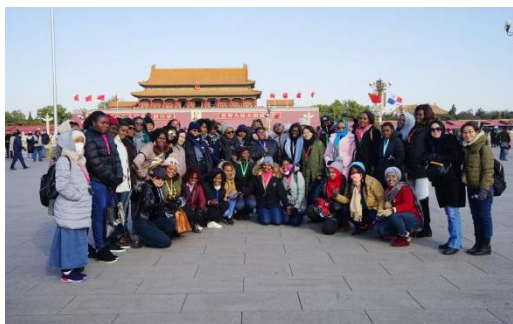
Tian An Men Square - The Heart of China

Professor of Law, Chairman of University Council of China Women's University, specialized in family inheritance law, women's human rights, women's law, civil law, etc.