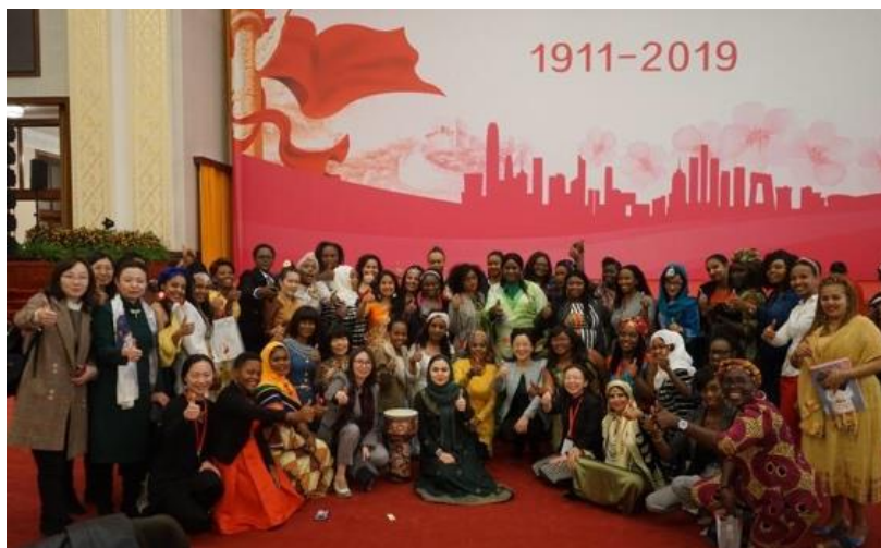
Reception of International Women's Day, Great Hall of the People

Ph.D., Professor of Law, specialized in women's property rights protection, civil law, women's law.