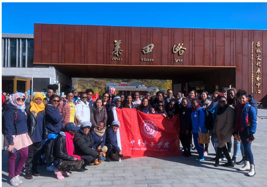
Visiting the Great Wall

Beijing has four distinct seasons, characterized by hot and humid summers, and generally cold and dry winters, meanwhile, springs and autumns are comfortable and pleasant. The average temperature in January is -3.7\text{ }^{\circ}\text{C} ( 25.3\text{ }^{\circ}\text{F} ), while 26.2\text{ }^{\circ}\text{C} ( 79.2\text{ }^{\circ}\text{F} ) in July. The cost of living in Beijing is a bit higher than most cities in China, with the food costs about 1200 yuan / month. Students are provided free single bedrooms in the international students' dormitory on the campus. Some of these rooms are equipped with private toilet and bathroom and will be assigned to new students by following the rule of 'first come first served'. Other facilities include public laundry, public kitchen 24-hour hot shower-water, and air conditioner and free Wi-Fi. Dormitory is accessible to students only.