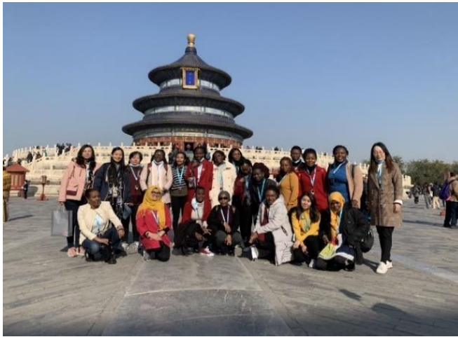
Visiting the Temple of Heaven

Assessment forms include course thesis statement, practice report and site report, etc. Credits are to be given only if the students pass the assessment in required courses. Thesis writing is to assess the students' capacity of integrating theories into their practice and policy analysis.