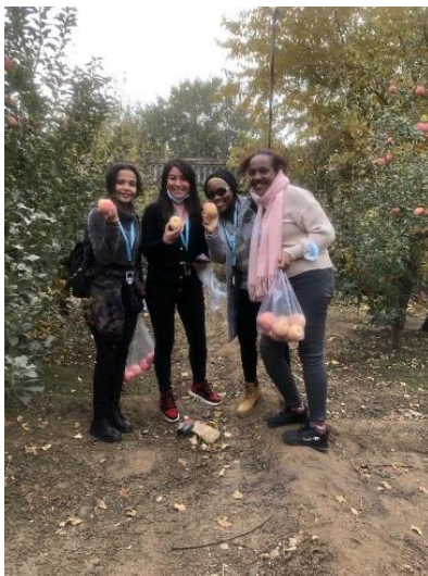
Picking up a Piece of Autumn

Assessment forms include course thesis statement, practice report and site report, etc. Credits are to be given only if the students pass the assessment in required courses. Thesis writing is to assess the students' capacity of integrating theories into their practice and policy analysis.