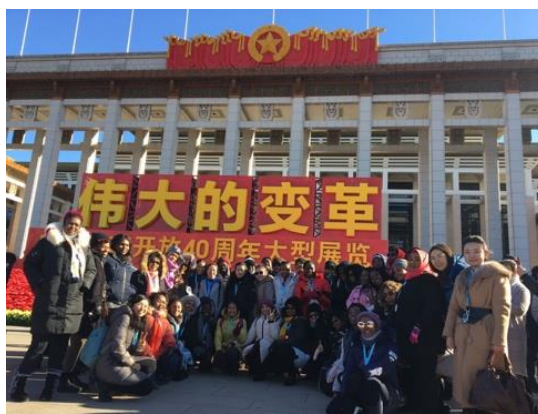
Understanding Chinese Experience

The courses' emphasis is laid upon applying interdisciplinary theories and multi perspectives of researching methods into practice, and let the students have a deeper understanding of gender and social development, women's leadership, as well as the theory and methods of women's participation in social development. The courses also aim at actively exploring the political and social factors hindering women from governance and decision-making. Theoretical studies will be combined with fieldwork and practices to effectively enable the students to better participate in government decision-making and governance. Students graduated from this program will possess both broad academic vision and solid professional basis to enhance their leadership capability, their ability to participate in government decision-making, as well as to advocate and encourage women's participation in social development in their home countries.