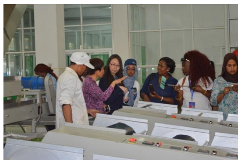
Fieldwork in Tea's Factory